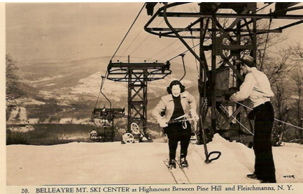
20. BELLEAYRE MT. SKI CENTER at Highmount Between Pine Hill and Fleischmanns, N. Y.

For the 2020 Fleischmanns Flyer, the Greater Fleischmanns Museum of Memories will highlight events that happened here over the past 11 decades. This month--the 40's & 50's